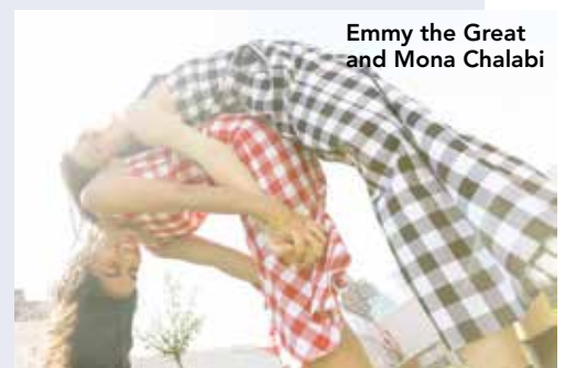
Emmy the Great and Mona Chalabi

Artists, scientists and designers explore the role creativity can play in the sustainability of developed urban areas. Share your opinions at Hong Kong Design Centre's Streetshop , an interactive exhibition gathering the public's thoughts on quality of life in Hong Kong. Newcastle University's Making the Invisible Visible shows the world's largest real-time urban sensing datasets and paints a live picture of pollution. While Migrant Workers: Seen and Heard is a collaboration between Hong Kong-born musician and writer Emmy the Great and British data journalist Mona Chalabi, who will transform Hong Kong statistics on migrant domestic workers into visuals and sound.