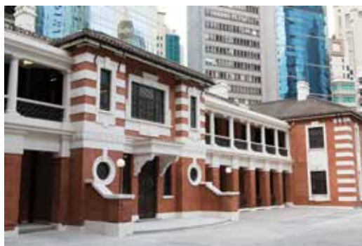
Block 01 Police Headquarters Block