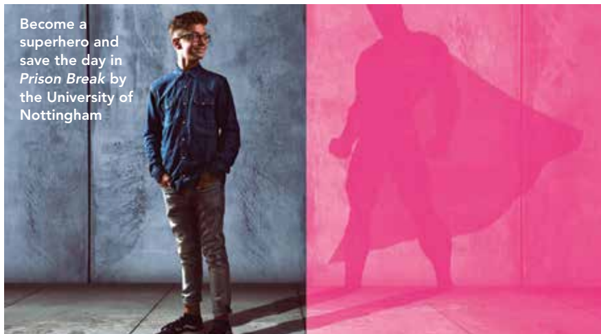
Become a superhero and save the day in Prison Break by the University of Nottingham

Please see next page for SPARK festival highlights.