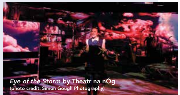
Eye of the Storm by Theatr na nÓg

How can young people in the UK and Hong Kong prepare for life and work in a globalised society? Learn about the creative skills and knowledge required to prosper in the face of AI, machine learning and other technological advancements. Theatr na nÓg's musical theatre extravaganza Eye of the Storm takes STEM education to the stage, featuring an original music score by Grammy Award winning songwriter Amy Wadge, who co-wrote Ed Sheeran's hit song "Thinking Out Loud". Aston University's School of Engineering and Applied Science will present Smart Cities Need Smart Students , an interactive exhibition demonstrating study routes for ambitious students who want to be part of the smart solution.